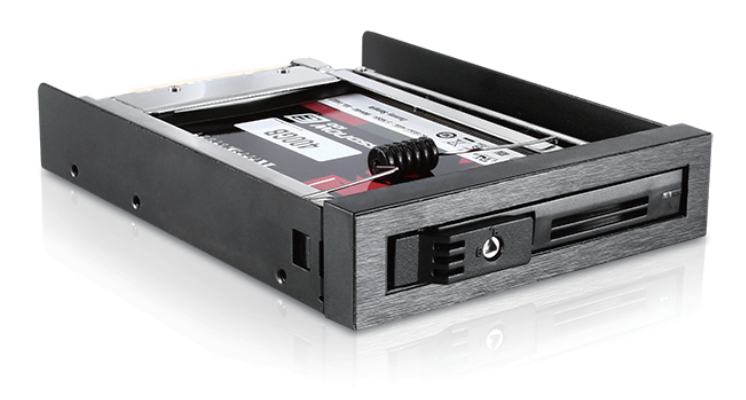
*2.5" HDD not included