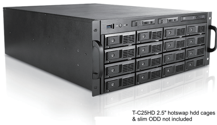
T-C25HD 2.5" hotswap hdd cages & slim ODD not included

4U 16-Bay Trayless Storage Server Rackmount Chassis 12Gb/s HDD SFF-8643 Backplane