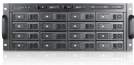
T-C25HD 2.5" hotswap hdd cages & slim ODD not included